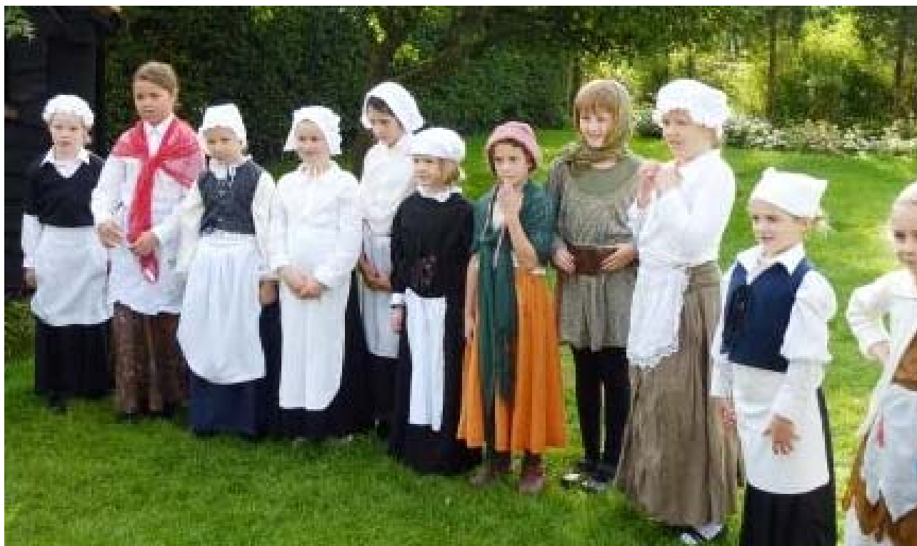
Ladyland Farm 2010.

We were blessed by a beautiful day for our annual trip to the Tudor Farm where we made bread and butter, fed sheep and chickens and learnt how Tudors made houses and felt. How many uses could you find for a pig? A Tudor could find at least six!