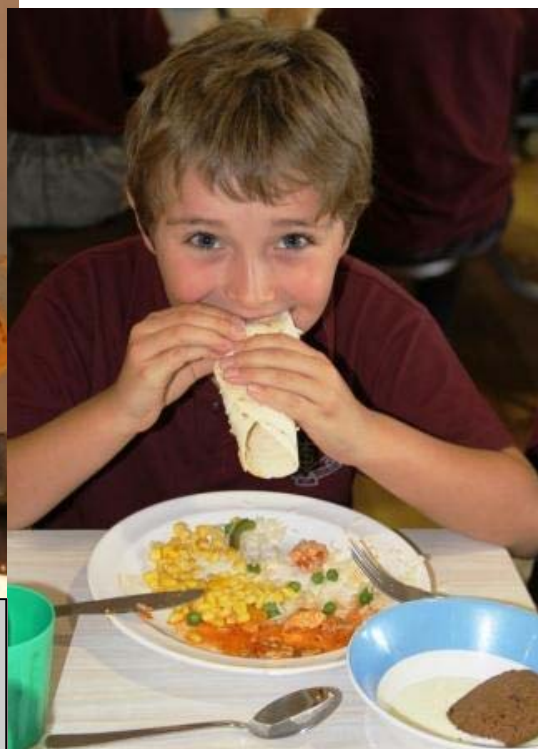
MEXICAN DAY. The recent Mexican themed lunch, saw Somerhill pupils and staff creating our own wraps and being served by Mexican hat wearing Senoras! As you can see from the photo, it proved a success with the boys!